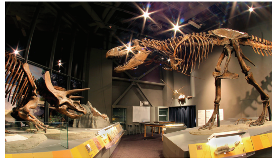
North Dakota Heritage Center, Adaptation Gallery: Geologic Time , Bismarck, ND.

The North Dakota Heritage Center's expansion is now complete. Four new galleries opened to the public in Bismarck, ND, on November 2, 2014, which was North Dakota's 125th Anniversary of Statehood.