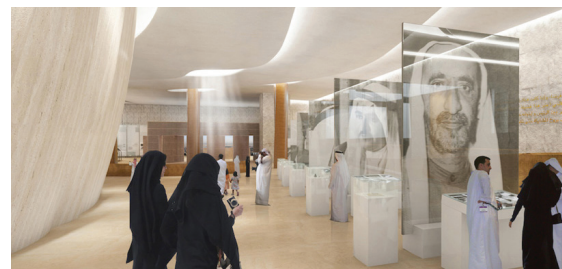
Union Museum.

UAE Vice President and Prime Minister and Ruler of Dubai His Highness Sheikh Mohammed bin Rashid Al Maktoum has endorsed the implementation of the Union Museum project. The 25,000 square-meter museum is adjacent to the Union House which witnessed the signing of the treaty establishing the United Arab Emirates federation in 1971. Lord Cultural Resources has been working on this project in Dubai since 2013. Our team was responsible for the interpretive planning and exhibition design, while Moriyama and Teshima was responsible for the building's architecture. We are delighted and honoured to see our plan for the experience, as we had envisioned it, get approval at the highest level.