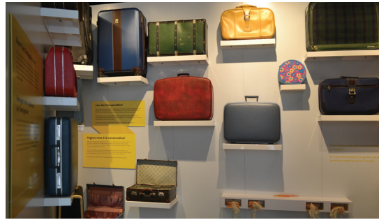
Canada: Day 1 Travelling Exhibition, Markham Museum, Markham, ON.

Visit www.lord.ca for client news, presentations, papers and upcoming events. To receive Cultural Capital by email, subscribe through our website www.lord.ca