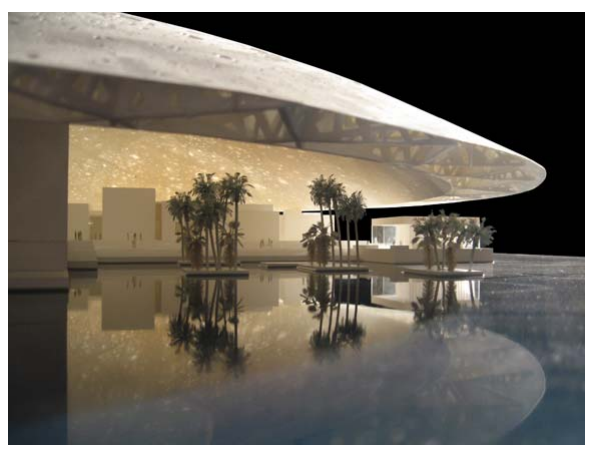
Model of Classical Museum by Ateliers Jean Nouvel